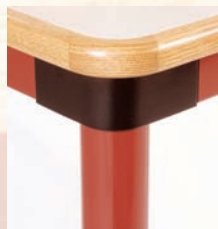
A 2" metal surround embraces a steel plate and machine bolt assembly of legs, tabletop and apron rail.

Legs and apron rails are crafted of 16-gauge steel, which is powder-epoxy coated for durability in a choice of colors. Tubular legs