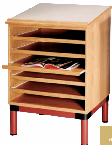
The Empire atlas stand is available with a panel or leg (shown here) base.

All shelves are faced with 3/4" grade "A" select veneer plywood or laminate and front edges are banded with 1/4" solid hardwood. Shelves are mounted to panels by means of metal flanges.