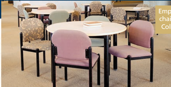
Empire reading tables and upholstered side chairs add vibrant color to San Diego Mesa College's $20M Learning Resource Center.