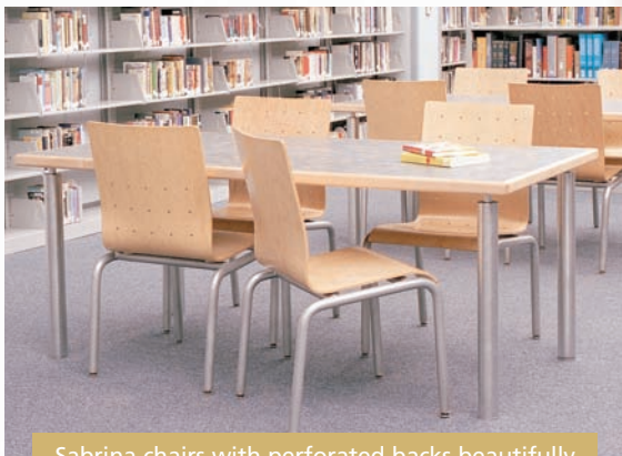
Sabrina chairs with perforated backs beautifully offset the tubular steel legs and marbled laminate work surface of Bridge reading tables at the Charles A. Wagner Branch Library in Metairie, LA.