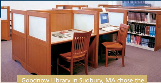
Goodnow Library in Sudbury, MA chose the decorative frosted glass insert option for its Ambassador modular study carrels.