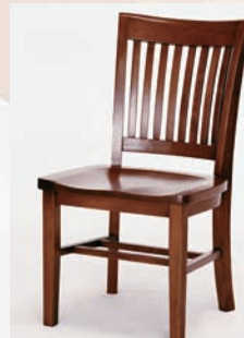
Ambassador side chairs feature eight solid back slats with upholstered or hardwood seats.

Ambassador side chairs are available with upholstered or saddled hardwood seats. Their solid hardwood frames feature a classic slat-back design and slightly radiused edges.