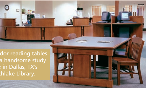
Ambassador reading tables provide a handsome study space in Dallas, TX's Southlake Library.

Painstaking handcraftsmanship transforms select veneers and solids into the Ambassador collection's